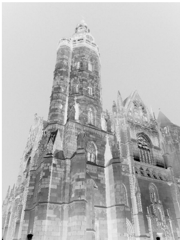
Fig. 12: St. Elisabeth Cathedral in Košice