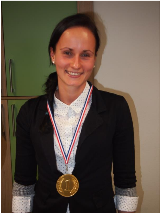
Fig. 4: Winner of the SVOC competition