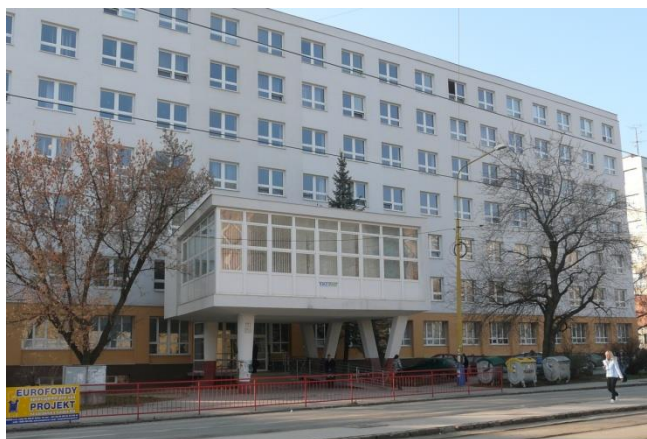
Fig. 1: The Faculty of Economics, Technical University of Košice

Mission of the Faculty: To develop knowledge and provide high-quality, professional education in the field of economic sciences. To contribute to the development of society and shaping of the regional economy through the provision of research and consultancy activity, continuing education and services for the local and regional communities.