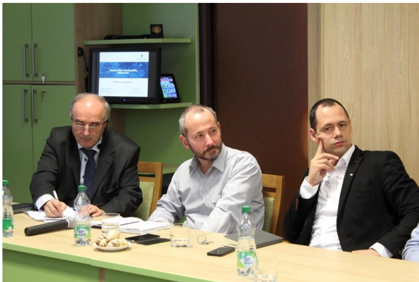
Fig. 10: March 2016: Jozef Makúch, governor of the National Bank of Slovakia, “Recent Monetary Policy Challenges, Banking Union”