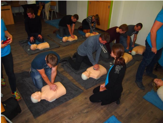
Fig. 7: Training of the first aid