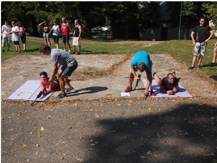
Fig. 11: Faculty Sports Day for staff and PhD students