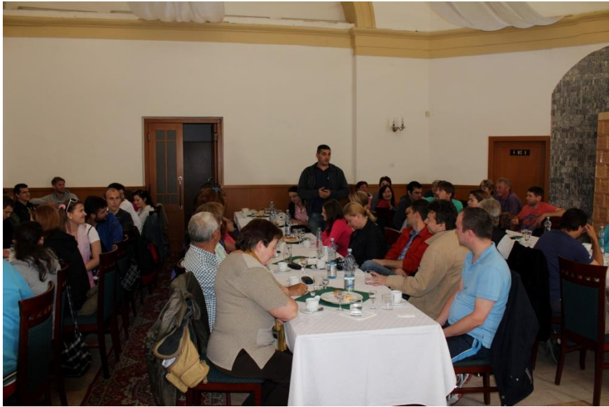
Fig. 3: Team-building day of the faculty