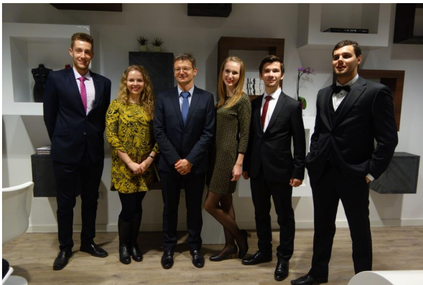
Fig. 8: Solemn graduation of Faculty students involved in the two degree programme at the University of Nice (France)