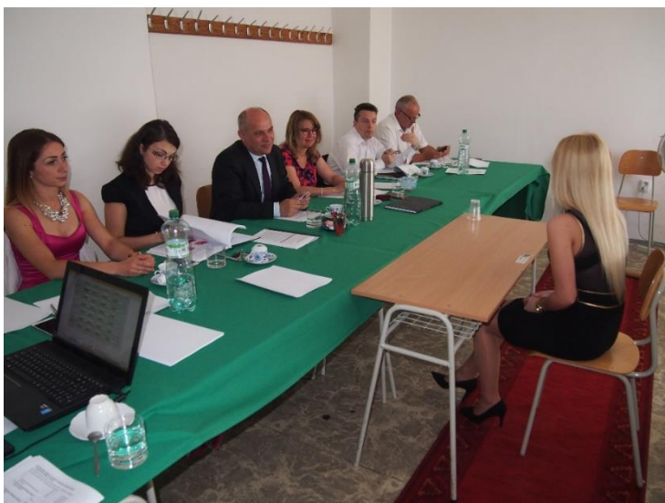
Fig. 6: Comitee of the Final state exams (Master degree programme)

In the academic year 2016/2017 (registered till October 31, 2016) 717 full-time Slovak students, 28 international students, part-time bachelor- and master-level students - 180 Slovaks and 1 international student, and 33 internal and 22 external PhD students study at the the Faculty.