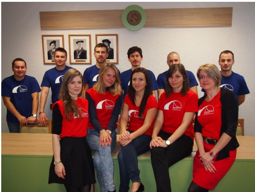
Fig. 5: Promotional event (“The Day of Open Doors”) for pupils of secondary schools interested in study at the Faculty of Economics

The Faculty of Economics offers accredited study programmes in the field of Finance, Banking and Investment and Economy and Management of Public Administration. The study programme in Business Informatics is offered in cooperation with the Faculty of Electrical Engineering and Informatics of the Technical University of Košice.