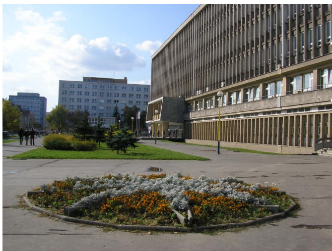
Fig. 2: The Technical University of Košice

In order to fulfil this mission, the Faculty fosters the spirit of democracy, tolerance and humanism, and supports critical and creative thinking among students. Innovation, quality, accountability, critical thinking and freedom of speech are the values which are shared by the Faculty staff.