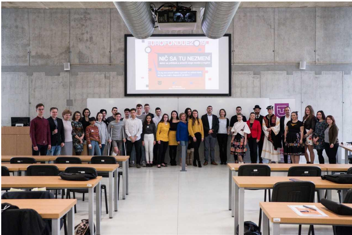
Fig. 10: Final of the competition. Finalist, judges and organisers. Eurofondue 2019

Eurofondue is an annual competition for high school students, arranged since 2013. It has been running under the auspices of member of European Parliament and with the cooperation of European Parliament Liaison Office in Slovakia since its beginning. Within the competition the students are encouraged to design development project in their locality or community. In 2019 almost 40 participants had opportunity to train their project skills and presentation skills during the educational workshops with the experts in February 2019. The final was held in March 2019 and the winning team was awarded by the trip to European Parliament.