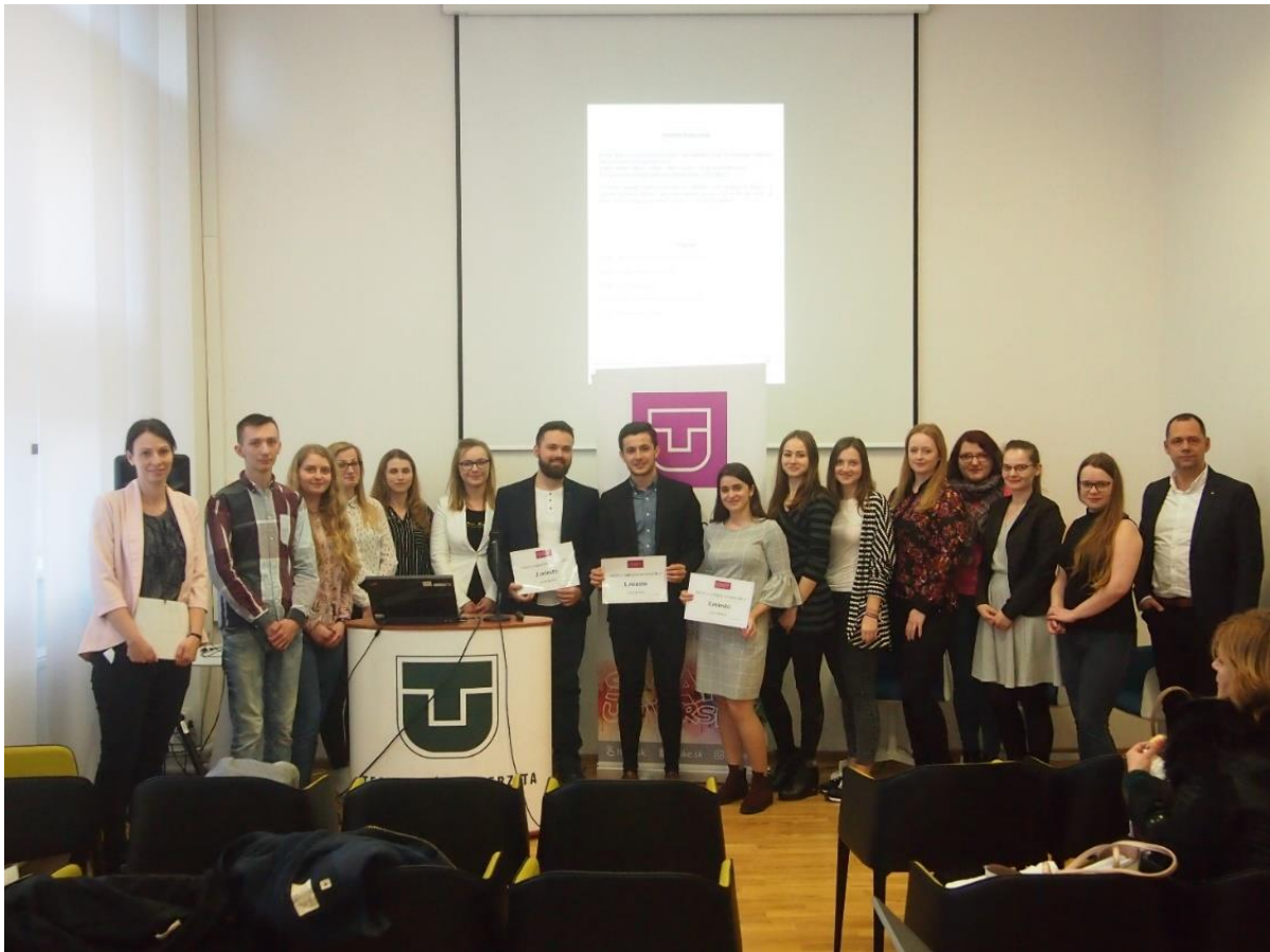
Fig. 4: Best Semmestral Project Competition 2019

Students of the Faculty are involved in the research activities as well. Faculty organizes a competition of students' research activities on annual basis. The competition aims to promote and attract students to participate collectively in small teams in preparing small professional projects. As a result, activity examines the ability of students to think, write and express, present and collaborate. The main objective of the competition is to create conditions and environment for the scientific and professional work of students, to stimulate the individual development of creative abilities and talent of students, as well as to support discussion and active presentation of the results of the work focused on economic science and their benefits for practice. The competition is organized for all faculty students except for PhD students. The winners at the Faculty level are nominated to national and international student competitions.