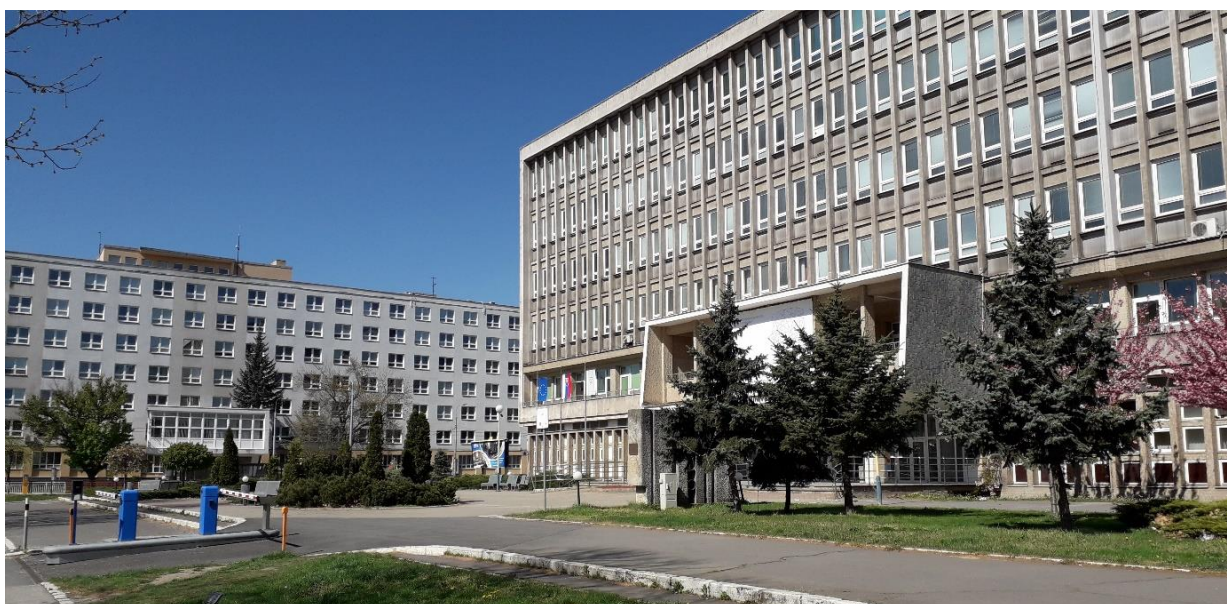
Fig. 1: The Faculty of Economics, Technical University of Košice

Mission of the Faculty: To develop knowledge and provide high-quality, professional education in the field of economic sciences. To contribute to the development of society and shaping of the regional economy through the provision of research and consultation activities, continuing education and services for the local and regional communities.