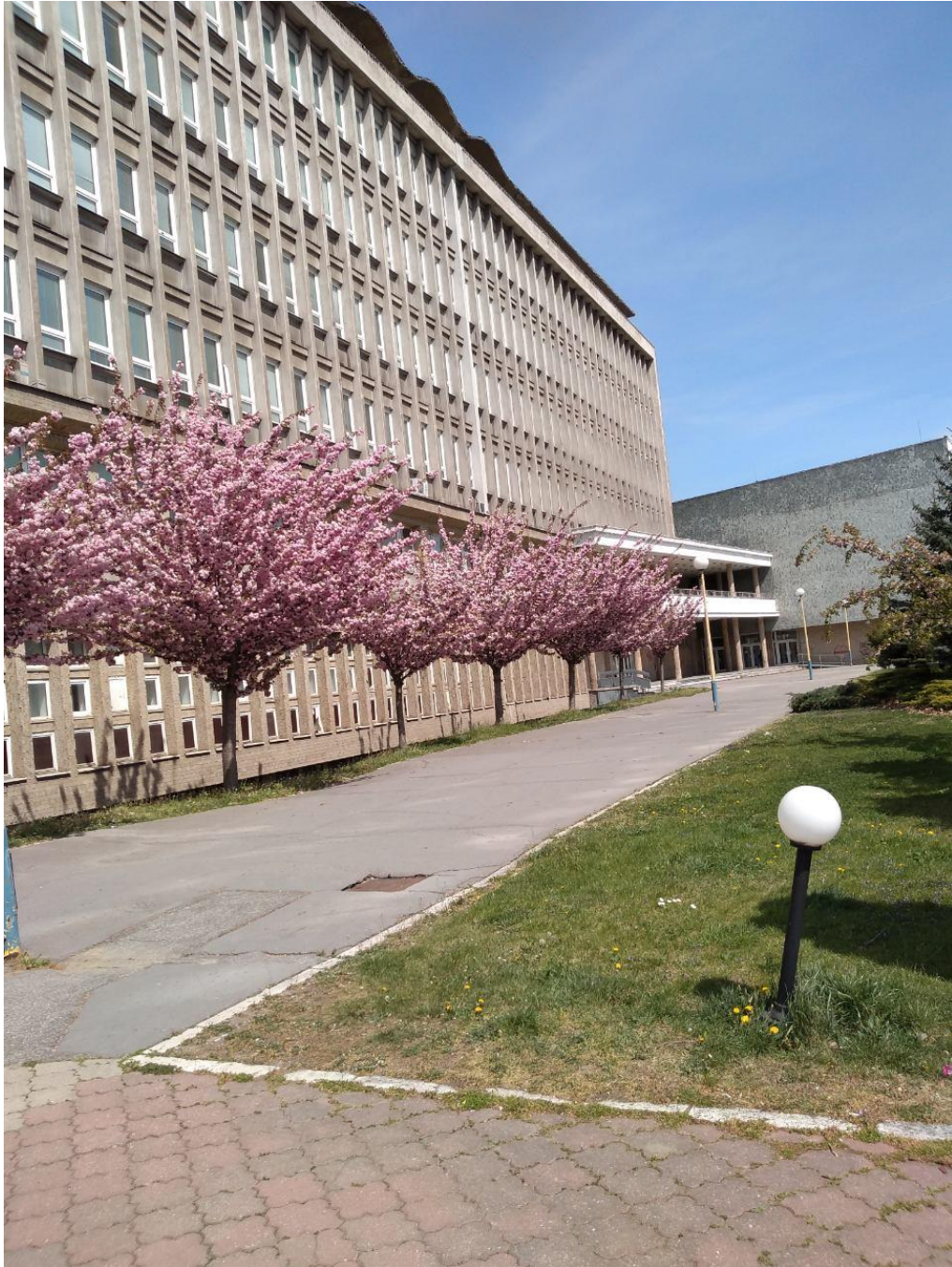
Fig. 2: The Technical University of Košice

In order to fulfil this mission, the faculty fosters the spirit of democracy, tolerance and humanism, and supports critical and creative thinking among students. Innovation, quality, accountability, critical thinking and freedom of speech are the values which are shared by the staff of the faculty.