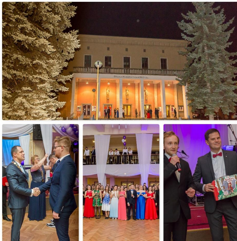
Fig. 11: Matriculation Ball 2019