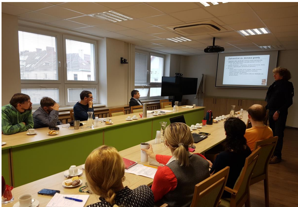
Fig. 5: Research workshop, December 2019

Second workshop, organised in December 2019, aimed to share and disseminate experience with project activities, to identify crucial project skills and to support and improve knowledge that represents the key to success in preparing high quality project proposals. Being competitive and successful in calls for project proposals in domestic and international project schemes is one of the highest priorities in the long-term mission of the faculty.