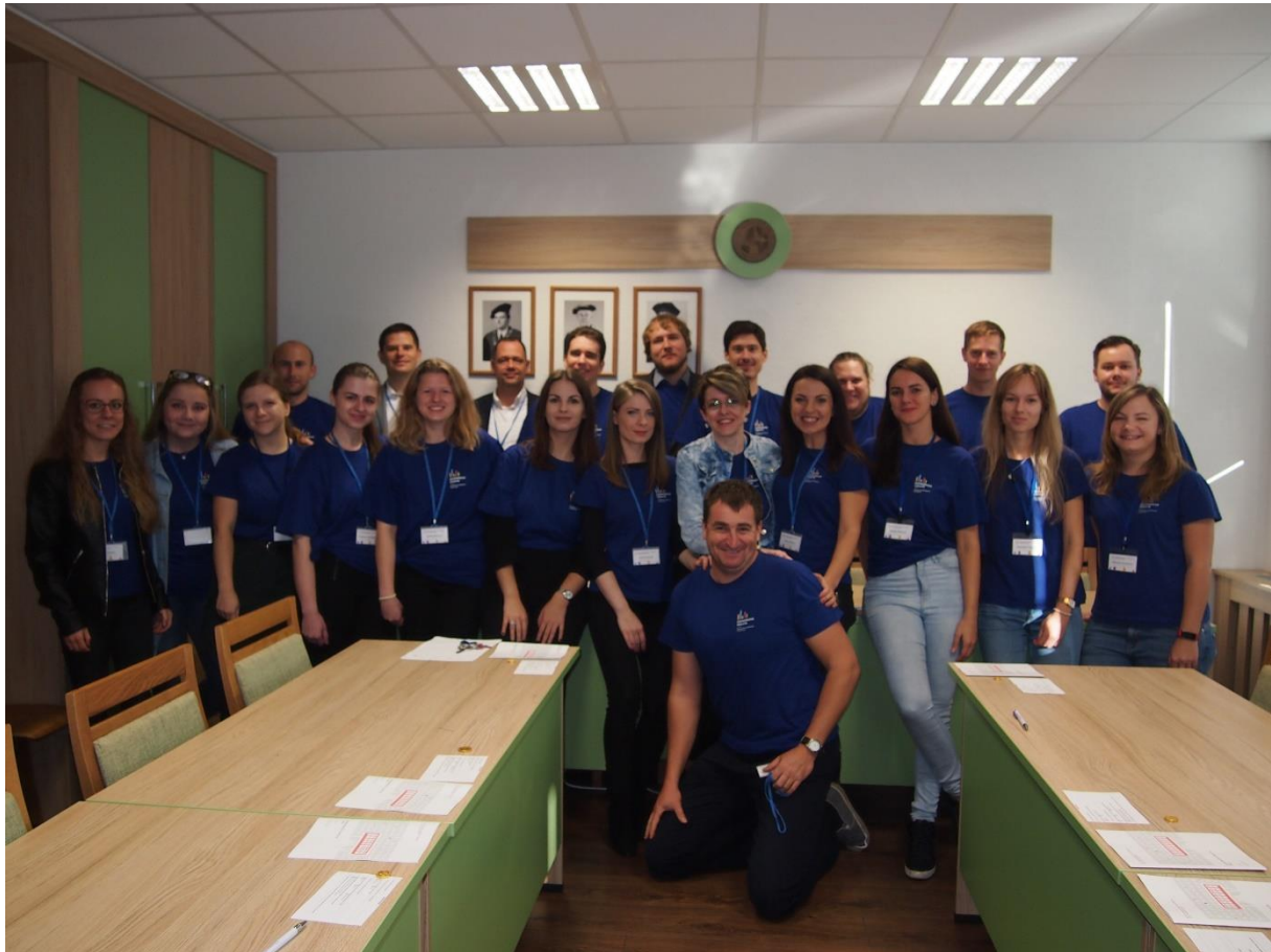
Fig. 6: Promotional event (“The Day of Open Doors”) for pupils of secondary schools interested in study at the Faculty of Economics

The Faculty of Economics offers study in two accredited study programmes – “Finance, Banking and Investments” and “Economy and Management of Public Administration”.