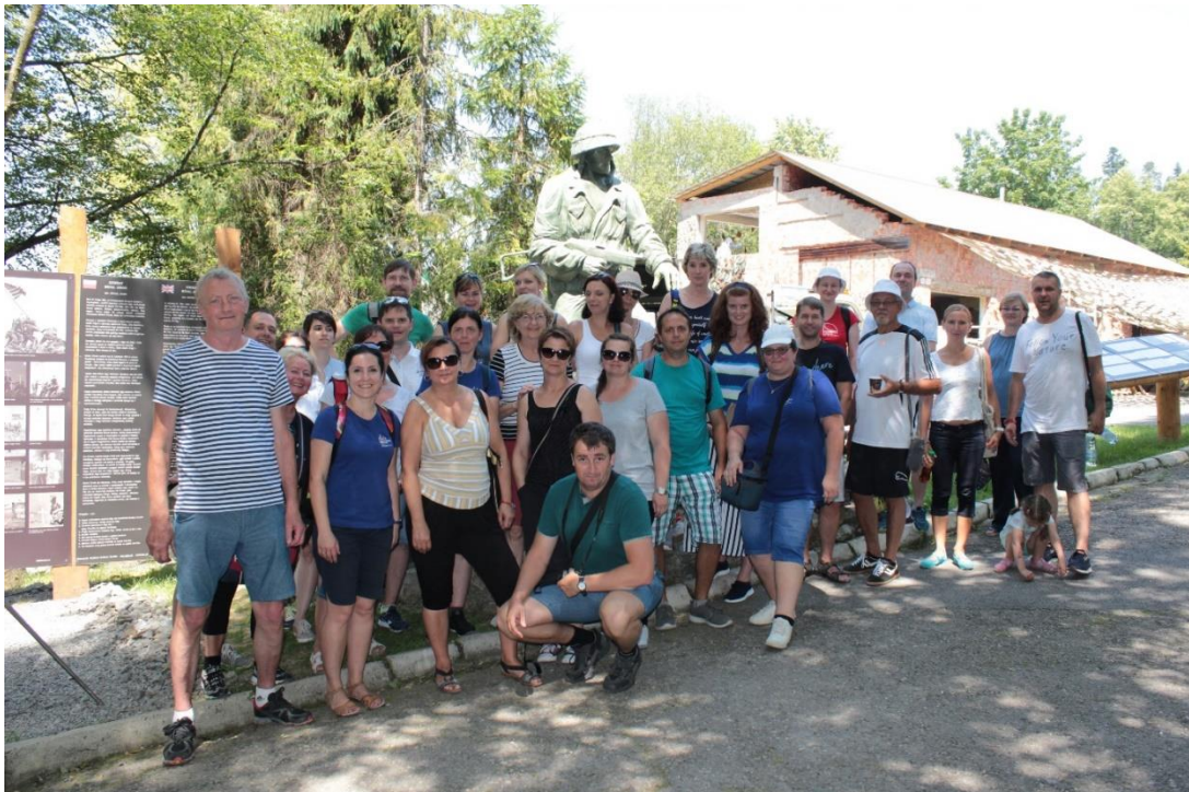
Fig. 3: Team-building day of the faculty