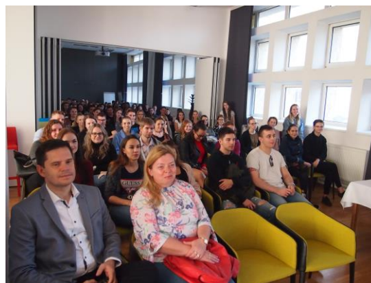
Fig. 8: ACCA Accelerate Programme Certification ceremony