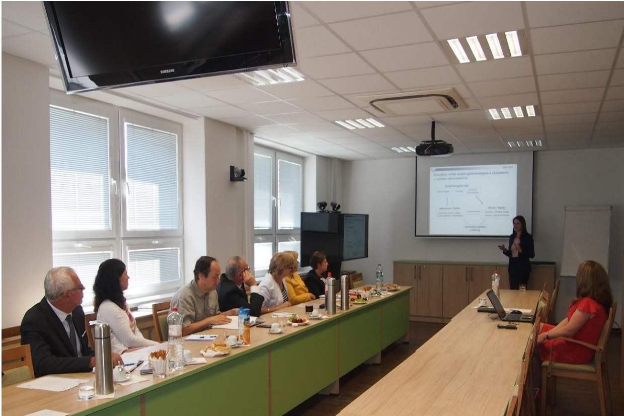
Fig. 7: Comitee of the Final state exams (PhD programme)

In the academic year 2018/2019 812 full-time Slovak students, 35 international students, 60 part-time bachelor- and master-level students, and 39 internal and 29 external PhD students study at our Faculty of Economics.