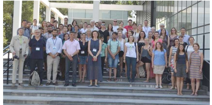
Summer School at UNS, Serbia, 2017