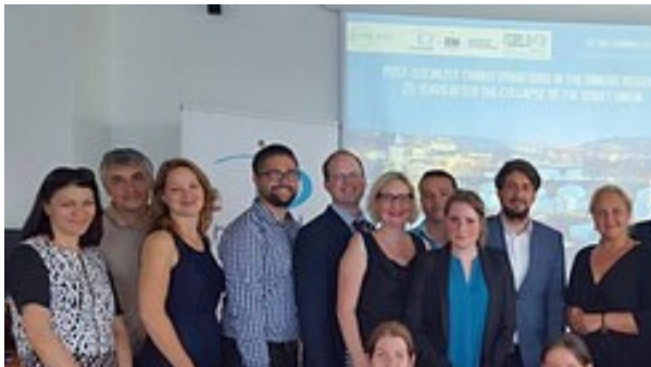
Summer School at CULS, Czech Republic, 2016