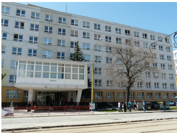
Fig. 1: The Faculty of Economics, Technical University of Košice

Mission of the Faculty: To develop knowledge and provide high-quality, professional education in the field of economic sciences. To contribute to the development of society and shaping of the regional economy through the provision of research and consultancy activity, continuing education and services for the local and regional communities.