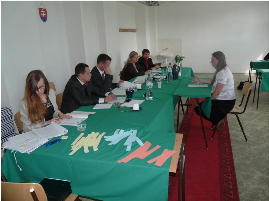
Fig. 5: Final state exams (Master degree programme)