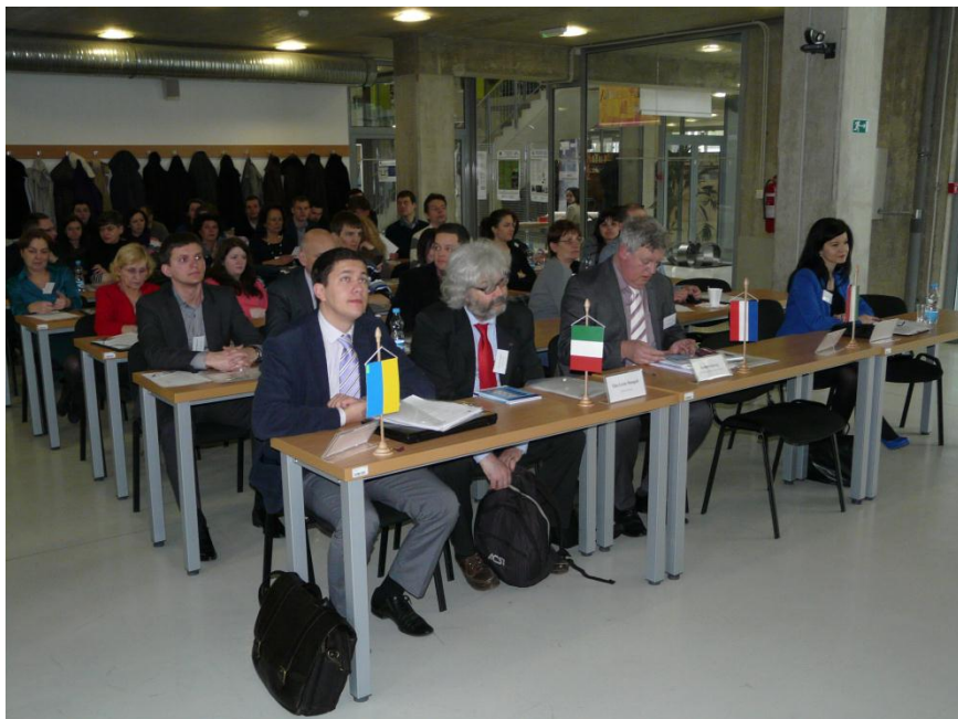
Fig. 6: SIGOLDproject meeting