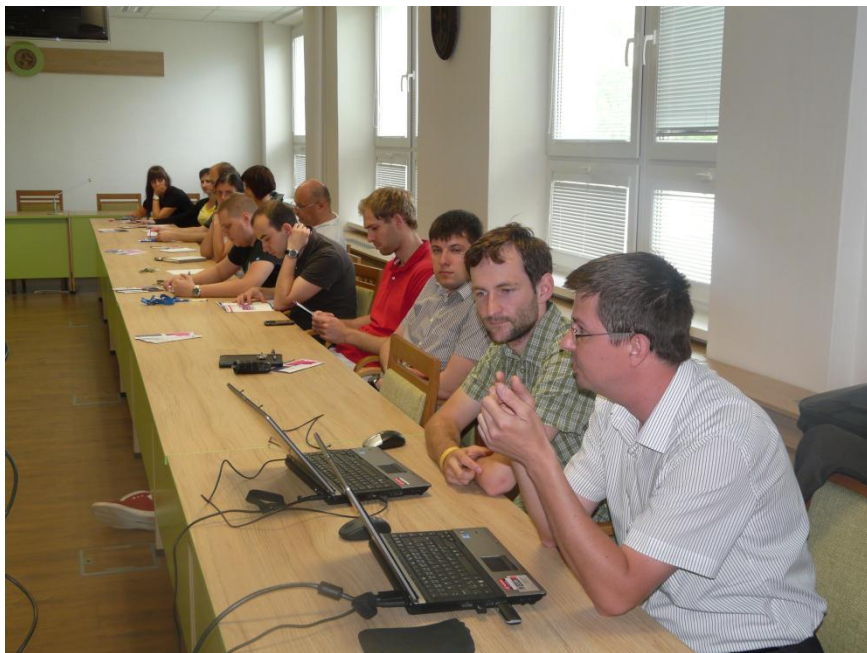
Fig. 9: Meeting with representatives of the Office of Statistics