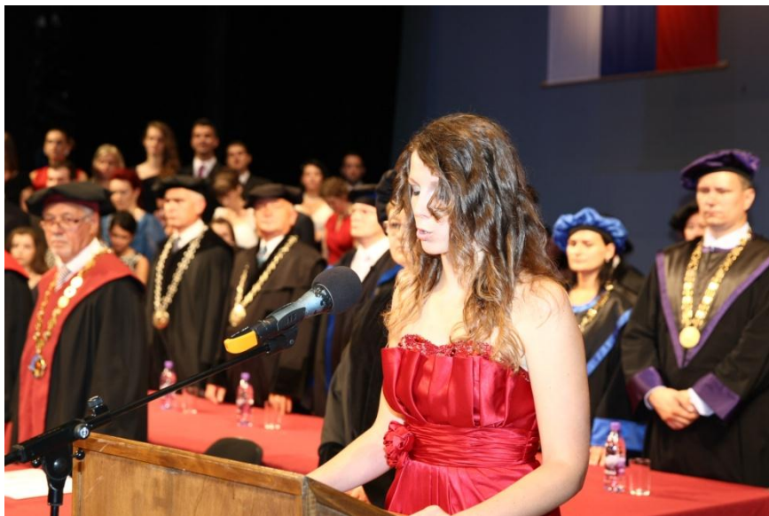
Fig. 7: Grand graduation ceremony

Based on the agreement with the Huddersfield University Business School in the UK, three students of the Faculty enrolled to the bachelor degree programme in Huddersfield and one to master degree in Teesside University in Middlesbrough in the academic year 2013/2014.