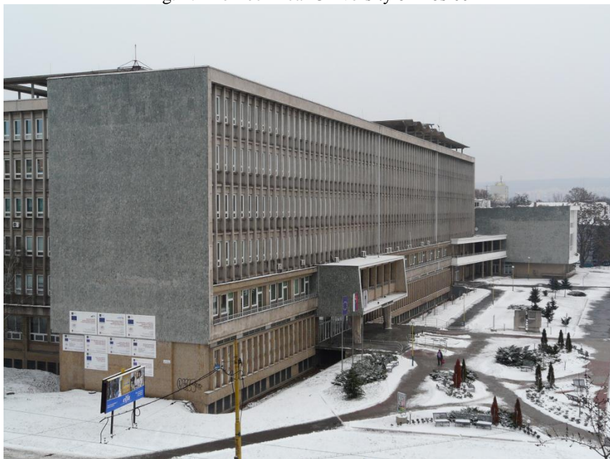
Fig. 2: The Technical University of Košice

In order to fulfil this mission, the Faculty fosters the spirit of democracy, tolerance and humanism, and supports critical and creative thinking among students. Innovation, quality, accountability, critical thinking and freedom of speech are the values which are shared by the Faculty staff.