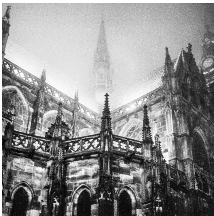
Fig. 10: St. Elisabeth Cathedral in Košice