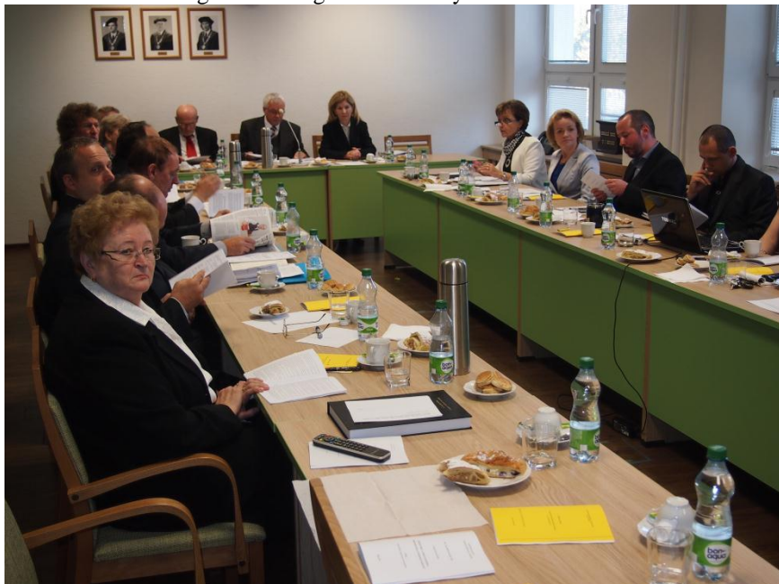
Fig. 3: Meeting of the Faculty Science Board

In research and development activities the Faculty cooperates with the Institute of Regional and Community Development of the Technical University of Košice ( http://www.tuke.sk/IRKR/ ).