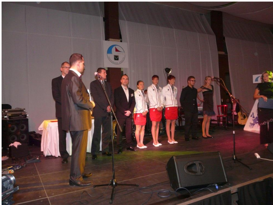
Fig. 8: 20 th Anniversary of the Faculty, founding members of the Alumni Association.