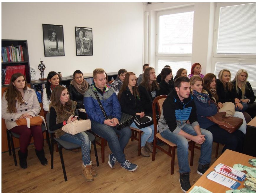
Fig. 4: Promotional event (“The Day of Open Doors”) for pupils of secondary schools interested in study at the Faculty of Economics

The Faculty of Economics offers accredited study programmes in the field of Finance, Banking and Investment and Public Administration and Regional Development. The study programme in Business Informatics is offered in cooperation with the Faculty of Electrical Engineering and Informatics of the Technical University of Košice.