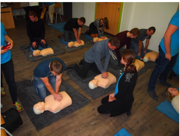
Fig. 7: Training of the first aid