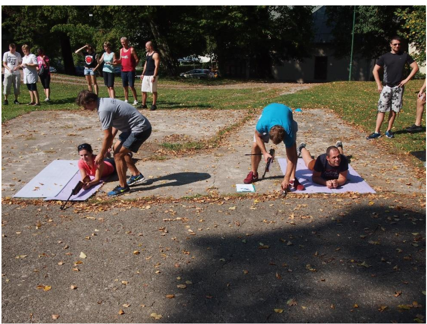
Fig. 11: Faculty Sports Day for staff and PhD students