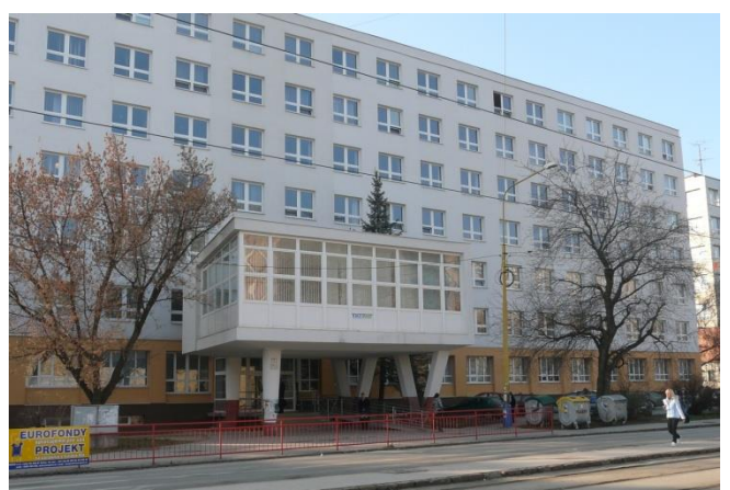
Fig. 1: The Faculty of Economics, Technical University of Košice

Mission of the Faculty: To develop knowledge and provide high-quality, professional education in the field of economic sciences. To contribute to the development of society and shaping of the regional economy through the provision of research and consultancy activity, continuing education and services for the local and regional communities.