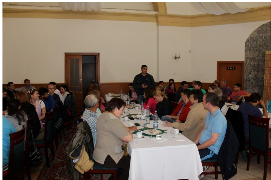
Fig. 3: Team-building day of the faculty