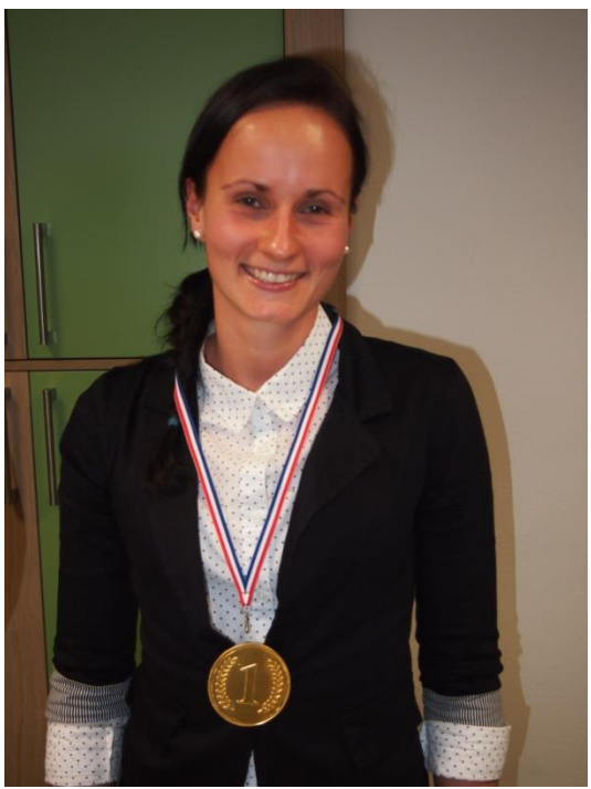
Fig. 4: Winner of the SVOC competition