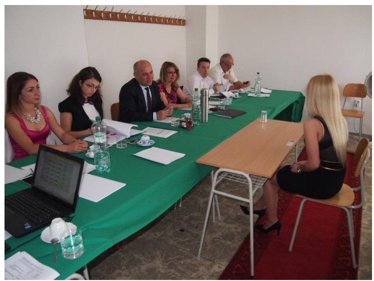
Fig. 6: Comitee of the Final state exams (Master degree programme)

In the academic year 2016/2017 (registered till October 31, 2016) 717 fulltime Slovak students, 28 international students, part-time bachelor- and masterlevel students - 180 Slovaks and 1 international student, and 33 internal and 22 external PhD students study at the the Faculty.