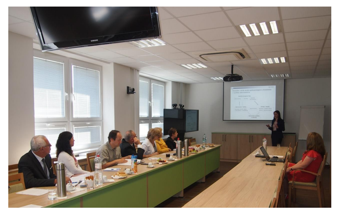
Fig. 6: Comitee of the Final state exams (PhD programme)

In the academic year 2017/2018 more than 800 full-time Slovak students, 30 international students, more than 100 part-time bachelor- and master-level students, and 31 internal and 22 external PhD students study at our Faculty.