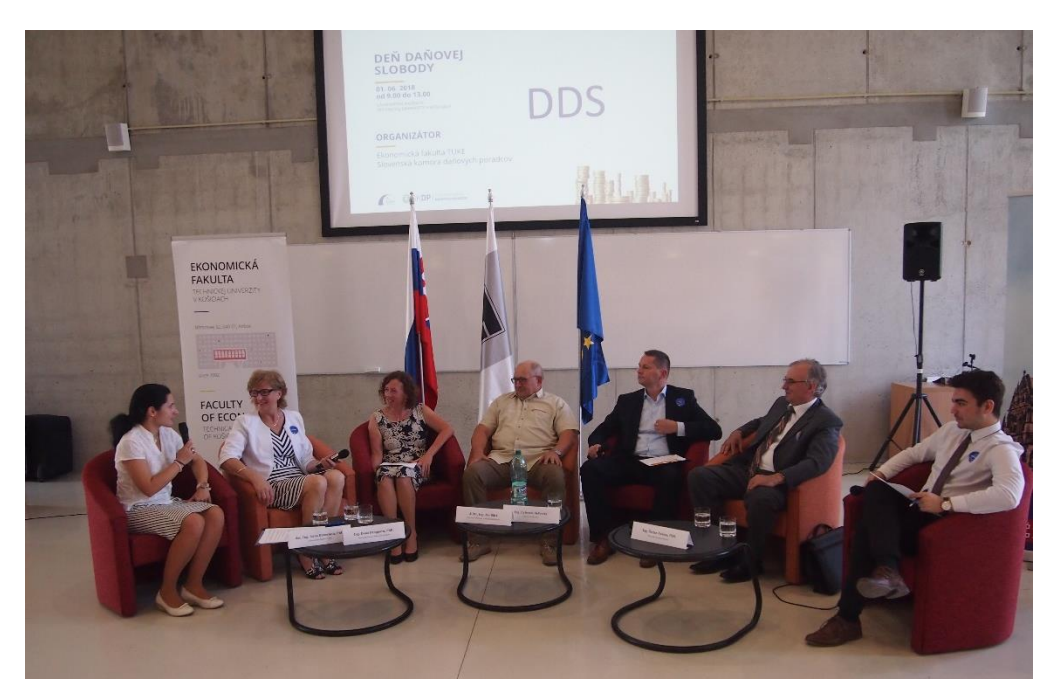
Fig. 7: The Day of Tax Freedom 2018 at EkF