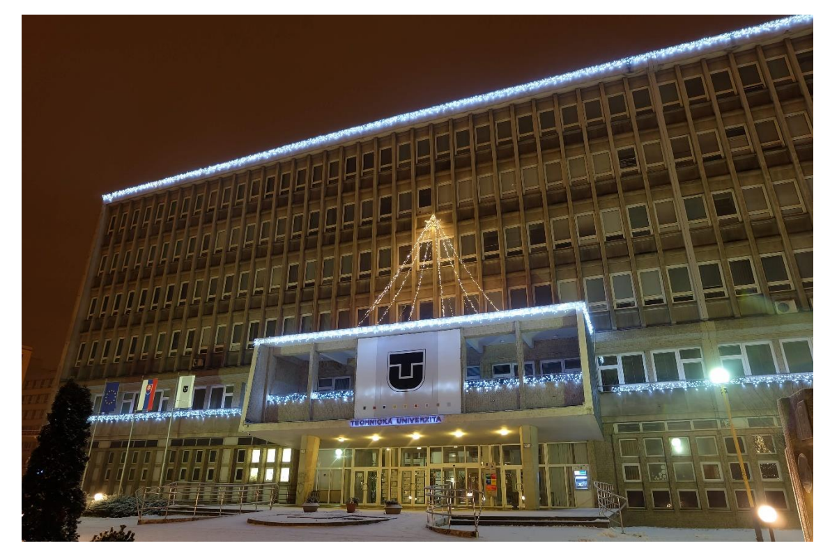
Fig. 2: The Technical University of Košice

In order to fulfil this mission, the Faculty fosters the spirit of democracy, tolerance and humanism, and supports critical and creative thinking among students. Innovation, quality, accountability, critical thinking and freedom of speech are the values which are shared by the Faculty staff.