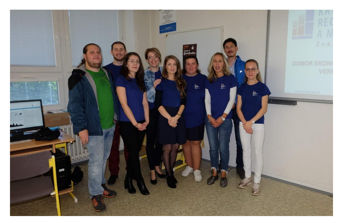
Fig. 5: Promotional event ("The Day of Open Doors") for pupils of secondary schools interested in study at the Faculty of Economics

The Faculty of Economics offers accredited study programmes in the field of Finance, Banking and Investment and Economy and Management of Public Administration.