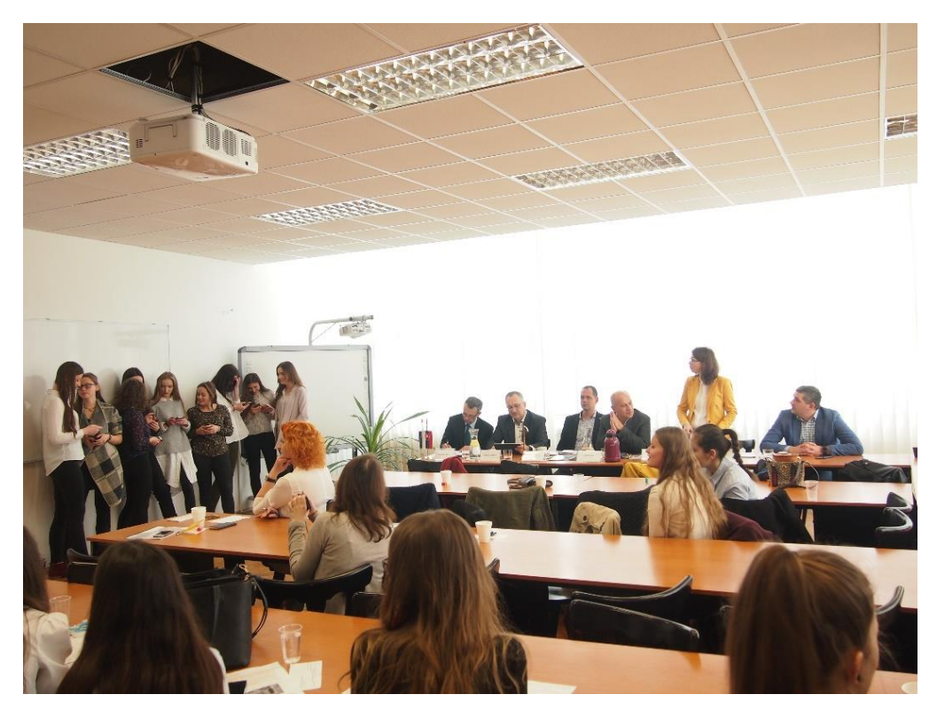
Fig. 10: Eurofondue!

The competition is running under the auspices of member of European parliament Vladimír Maňka since 2013. The students of high schools have to elaborate project related to the development of their locality of the community. The best project is winning the trip to European Parliament.