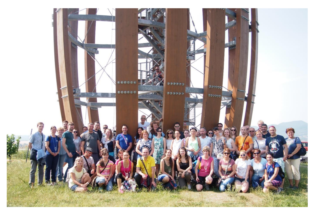
Fig. 3: Team-building day of the faculty

In research and development activities, the Faculty cooperates with the Institute of Regional and Community Development of the Technical University of Košice (<u>http://www.tuke.sk/IRKR/).</u>