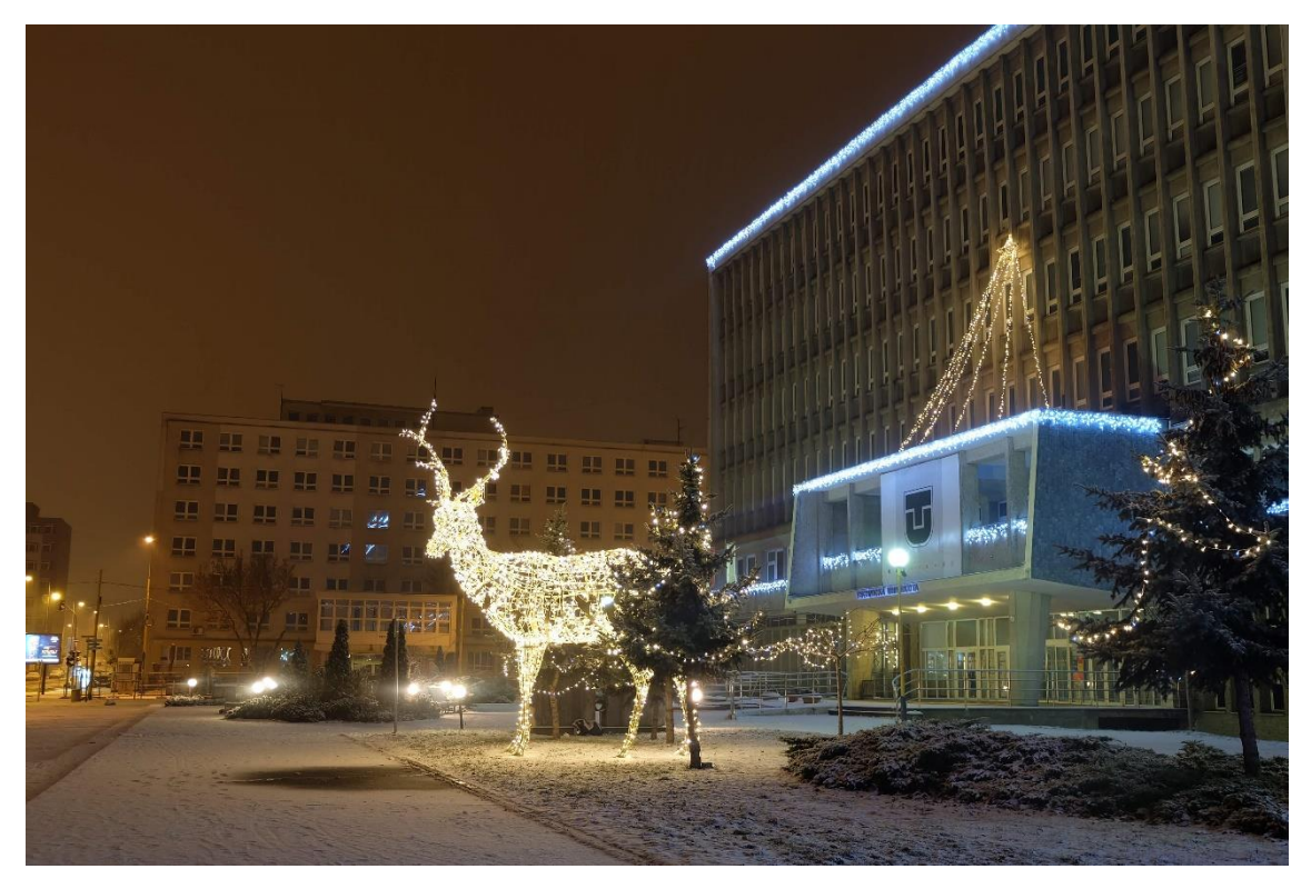
Fig. 1: The Faculty of Economics, Technical University of Košice

Mission of the Faculty: To develop knowledge and provide high-quality, professional education in the field of economic sciences. To contribute to the development of society and shaping of the regional economy through the provision of research and consultancy activity, continuing education and services for the local and regional communities.